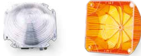
Internal diffuser and special lens pattern for optimal 360° signalling effect